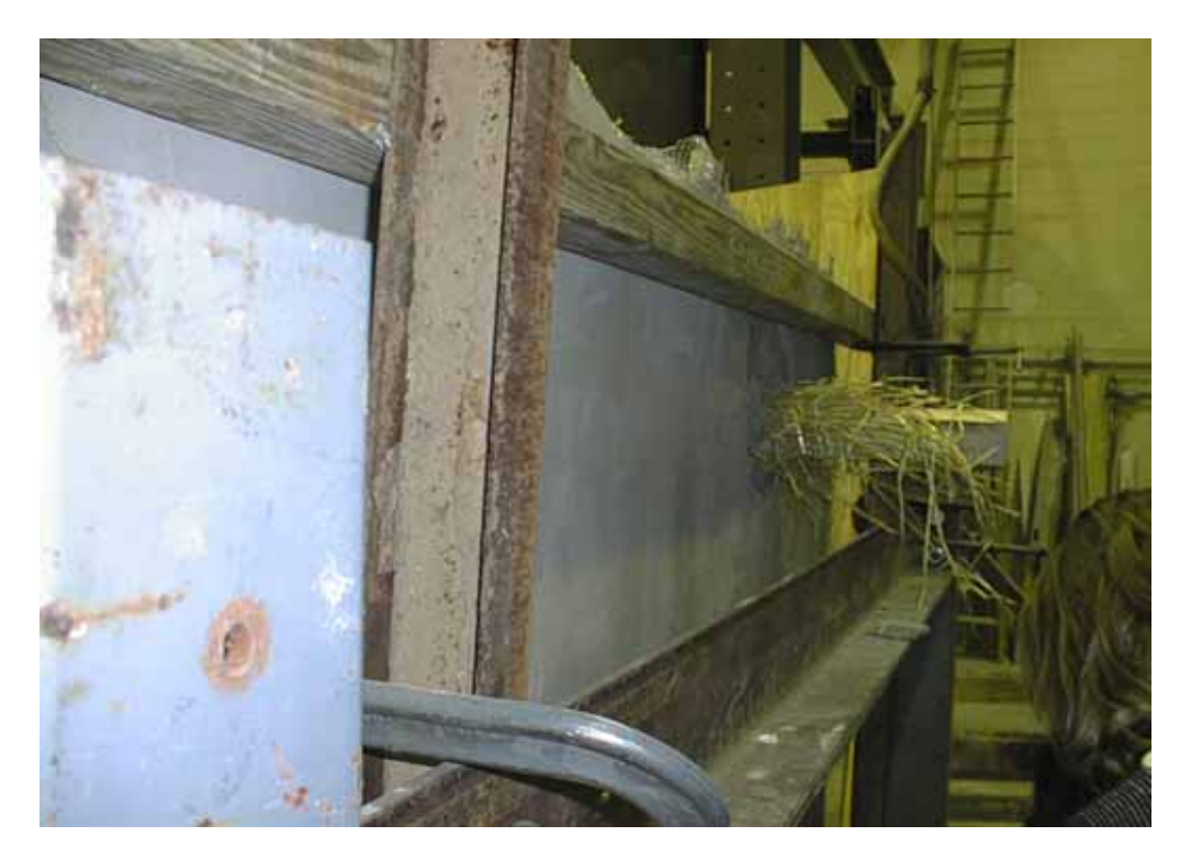
Shot III - Non-impact Surface