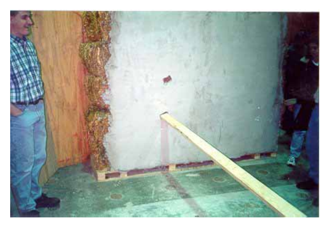
Shot II – Impact Surface

The missile impacted near the seam between the bales. The mesh was the wire type. The missile penetrated the wall 21 in. The missile impact caused spalling of the stucco on the non-impact surface. There was no damage to the wire mesh.