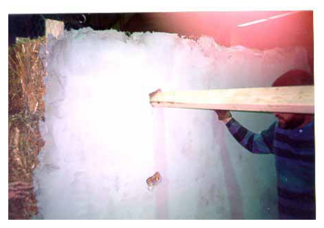
Shot III - Impact Surface

The missile impacted just above the seam between the bales. The mesh was the wire type. The missile perforated the wall 15 in. The missile impact caused large pieces of stucco to spall from the non-impact surface.