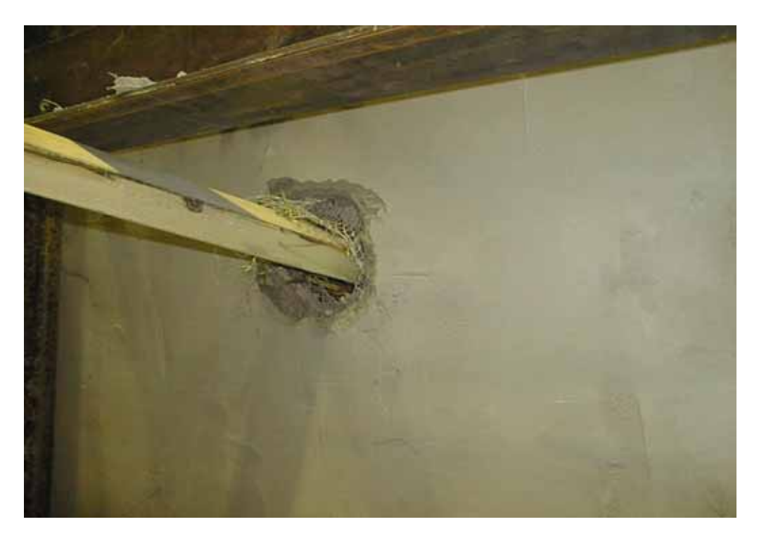
Shot V – Non-impact Surface Viewed From Side