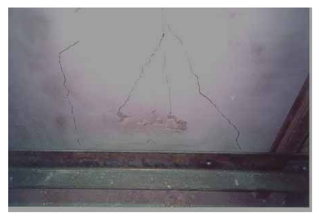
Shot II - Non-impact Surface