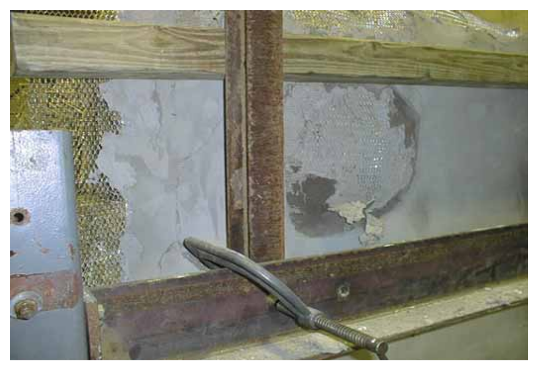
Shot IV – Non-impact Surface