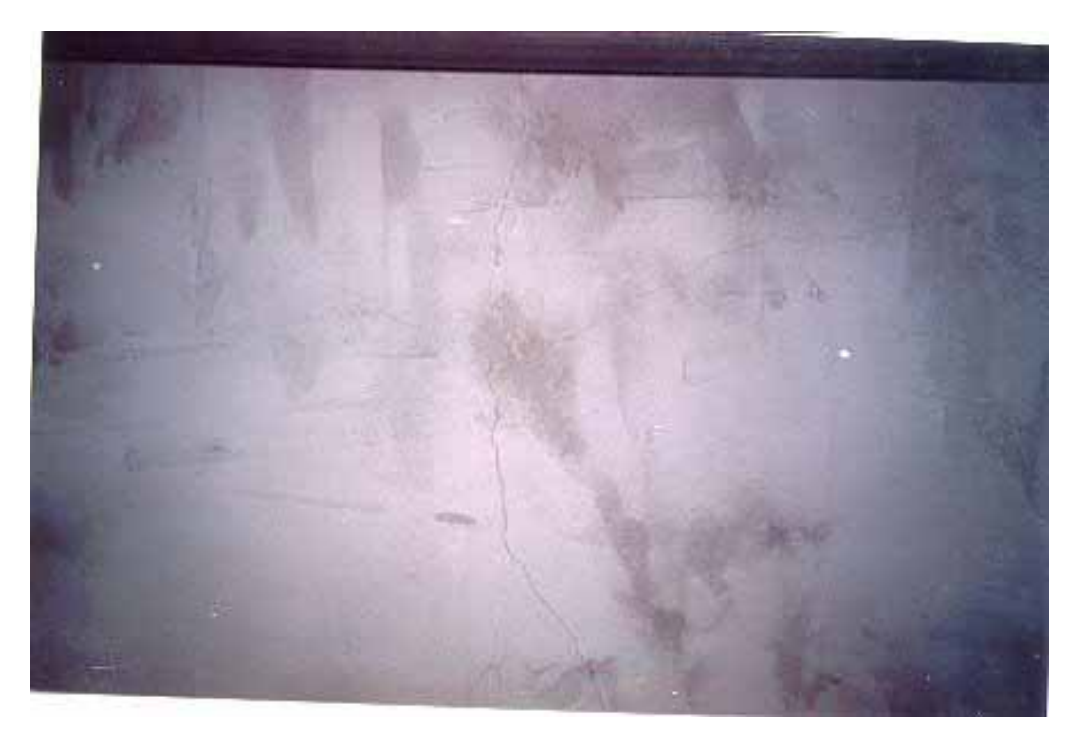
Shot I - Non-impact Surface