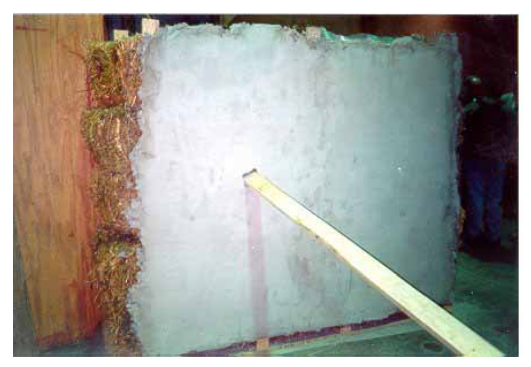
Shot I – Impact Surface

The missile impacted near the seam between the bales. The mesh was the wire type. The missile penetrated the wall 13 in. The missile impact caused small radial cracks in the stucco on the non-impact surface.